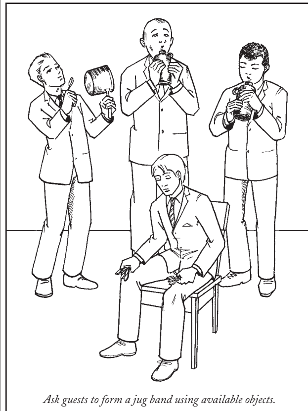
Ask guests to form a jug band using available objects.

Ask guests to blow across the tops of jugs of wine or whiskey. Others can bounce sets of spoons on their leg or torso. Pots and pans from the kitchen can be beaten with spoons or other cutlery. Others can play hambone, slapping thighs, chest, and face as a rhythmic accompaniment.